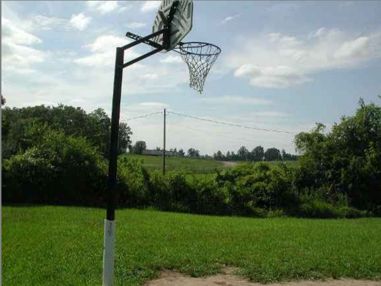
Basketball goal in Harry Holt front yard with Dickson County Landfill mound in clear sight across fence in background