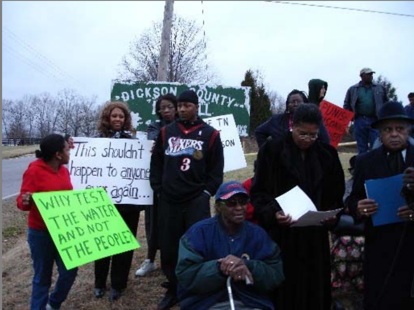
Protest held at the Dickson County Landfill on Dr. Martin Luther King Day January 2006