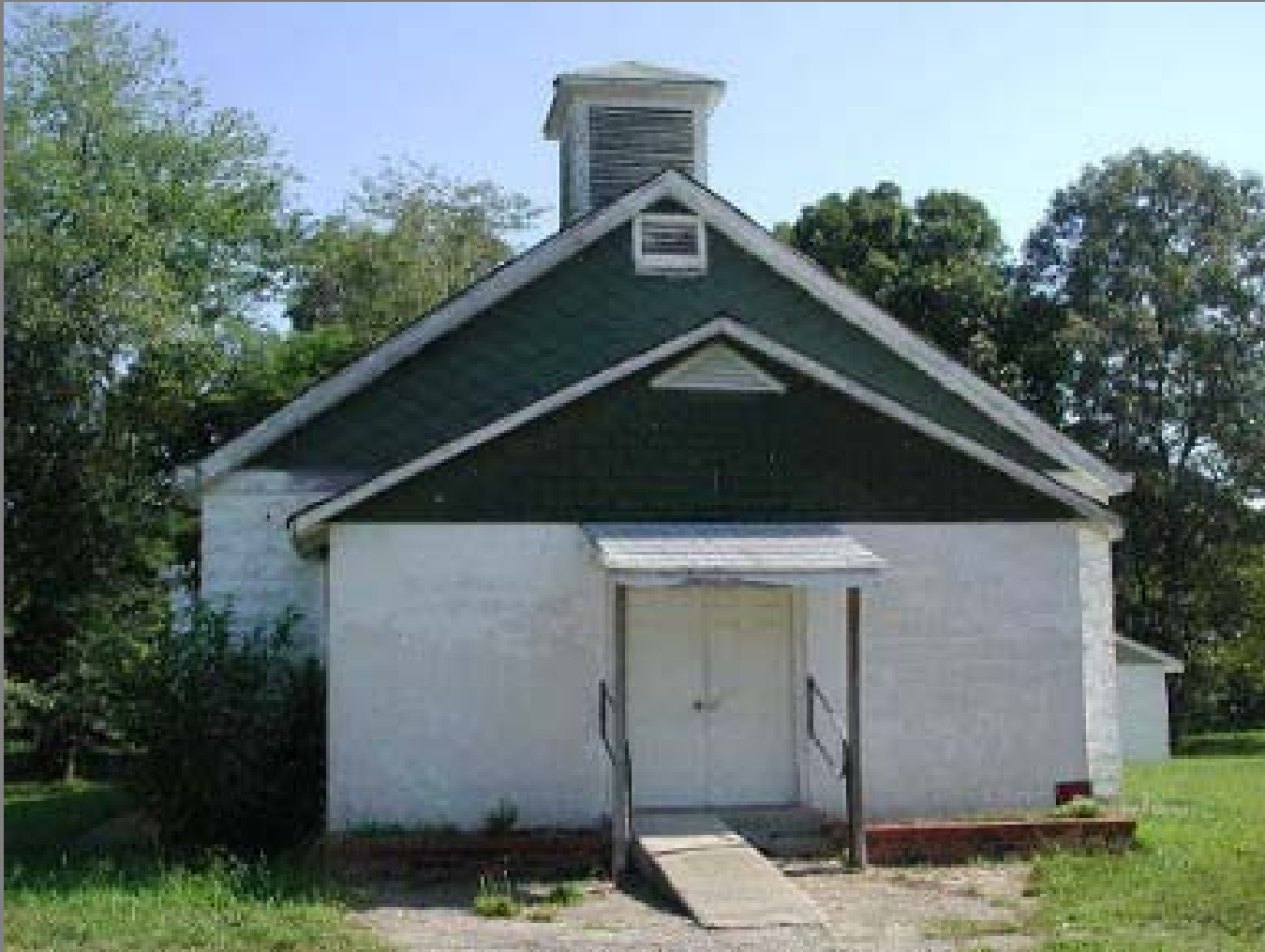
The Worley Furnace Baptist Church (Old) is a major cultural institution in the Eno Road Community