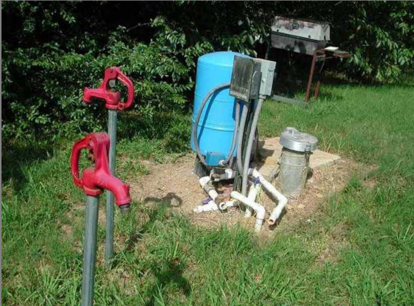
Harry Holt's old contaminated well and new water pumps in backyard