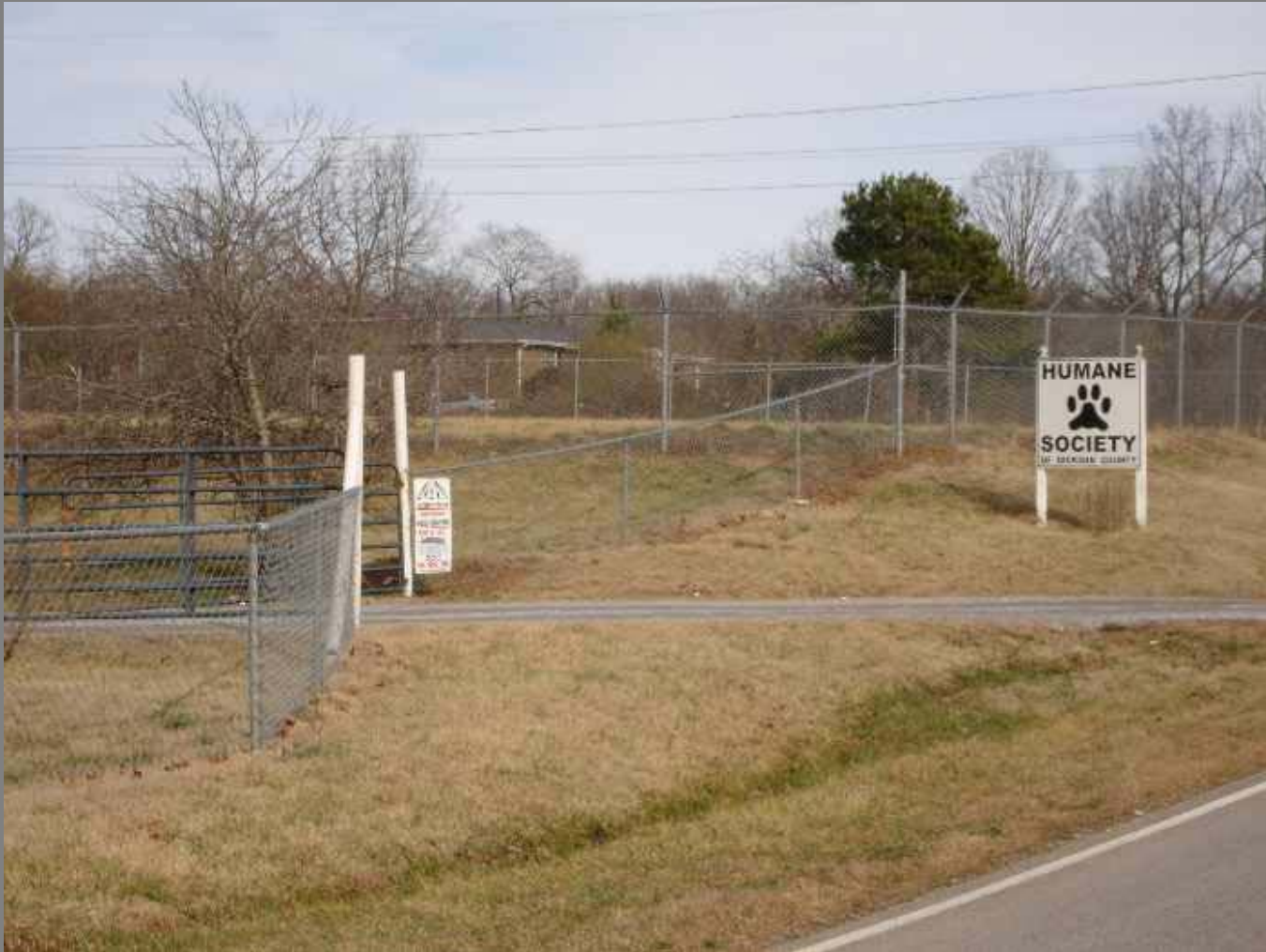
The Humane Society of Dickson County (HSDC), located across the road from the Harry Holt homestead, houses more than 300 animals per month, nearly 4,000 per year