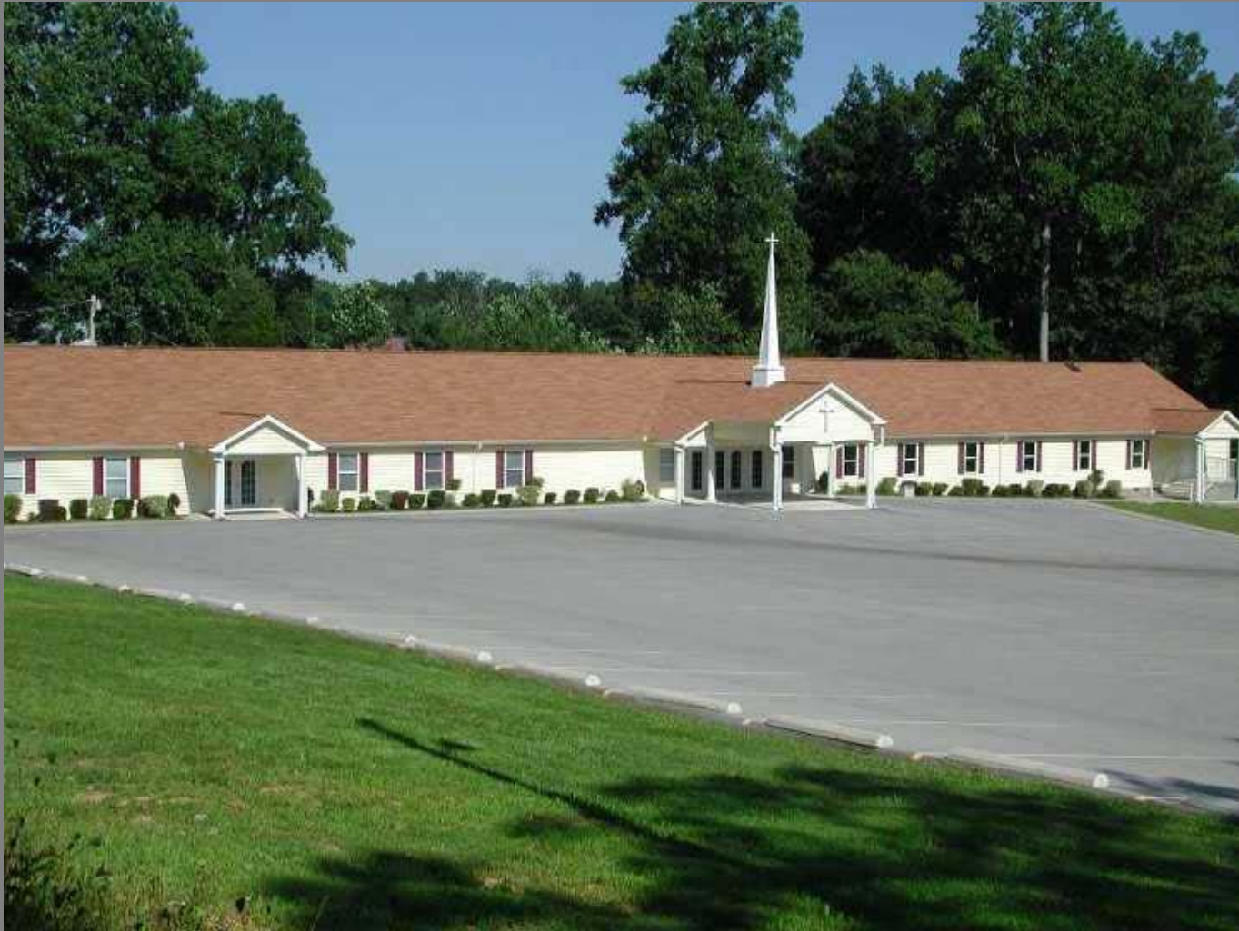
Worley Furnace Baptist Church (New)