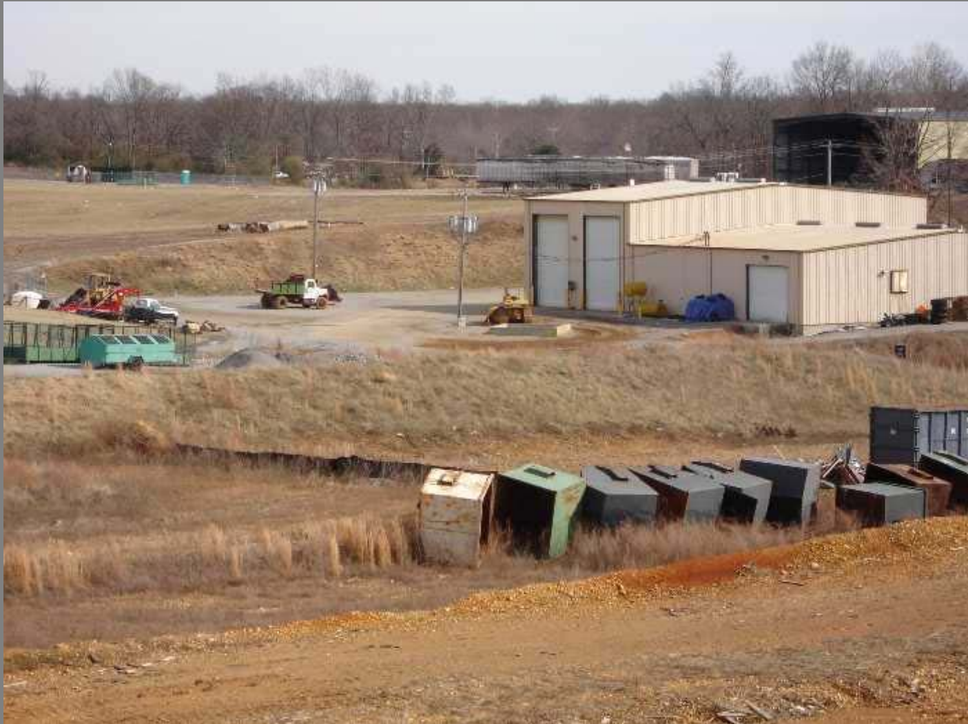
Looking east across the landfill and thru the trees one can see the Harry Holt homestead and cars parked in his driveway