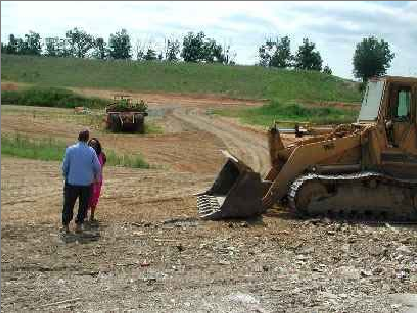
Dickson County Class IV Construction and Debris Landfill site