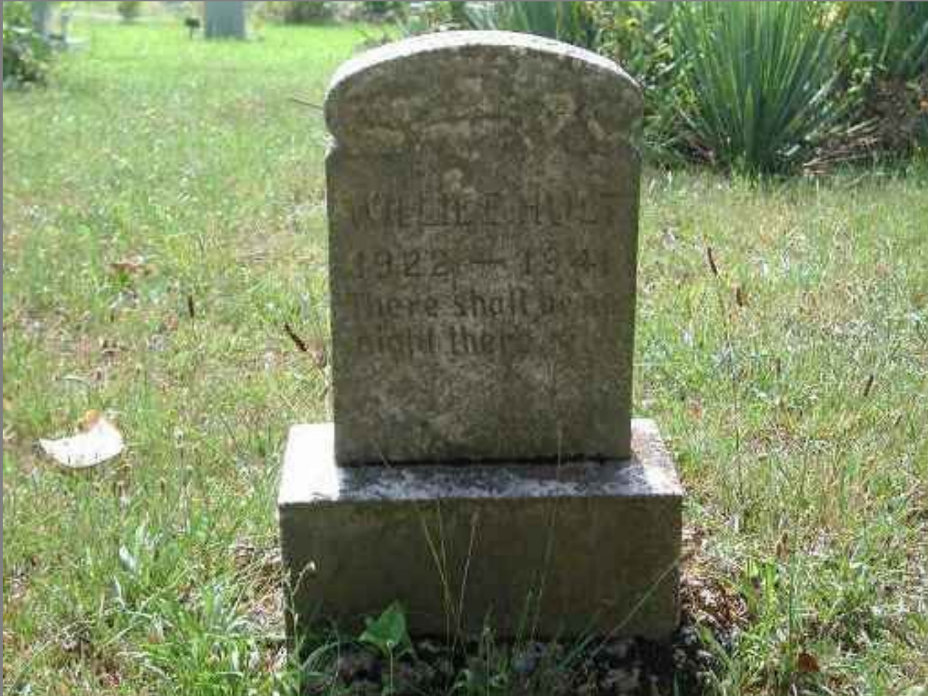
A 1941 Holt Family member headstone in the Worley Cemetery