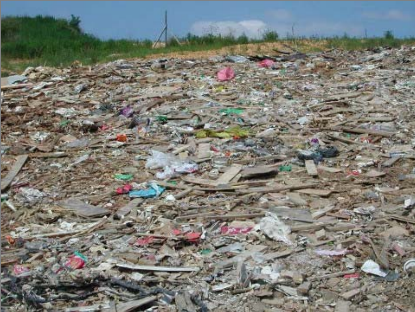
Uncovered waste at the Dickson County construction and debris landfill