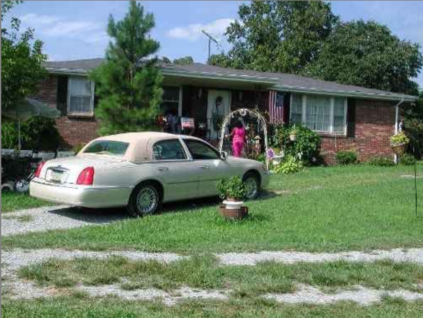
Harry Holt homestead off Eno Road and Worley Cemetery Road