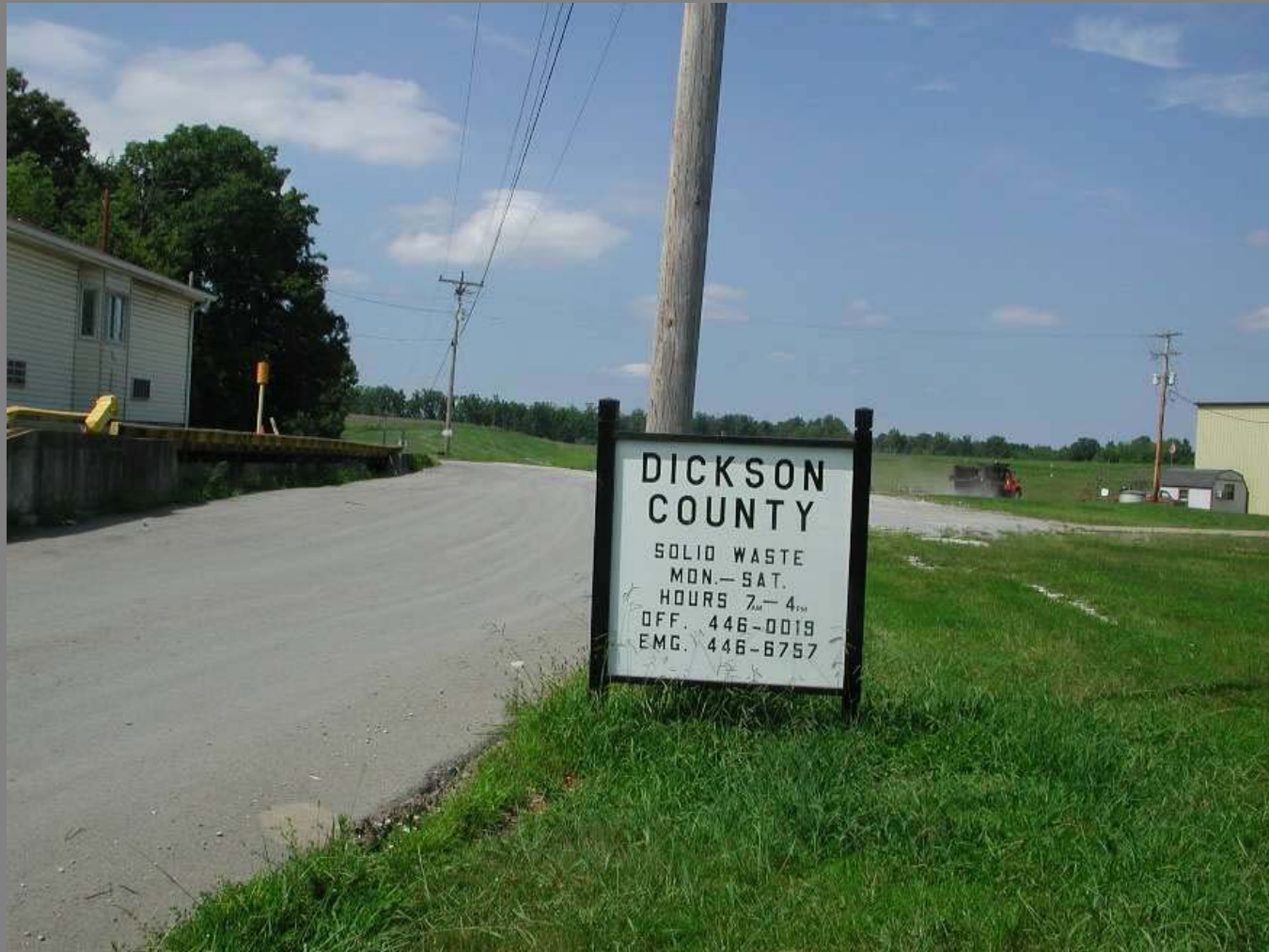
Dickson County Landfill on Eno Road