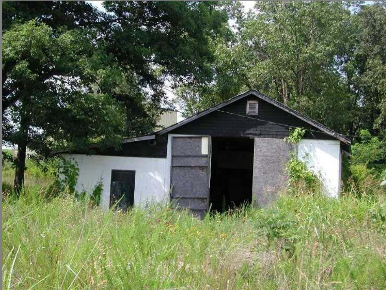
The one-room “Jim Crow” Coaling School site with Dickson County Landfill facilities visible through trees in background